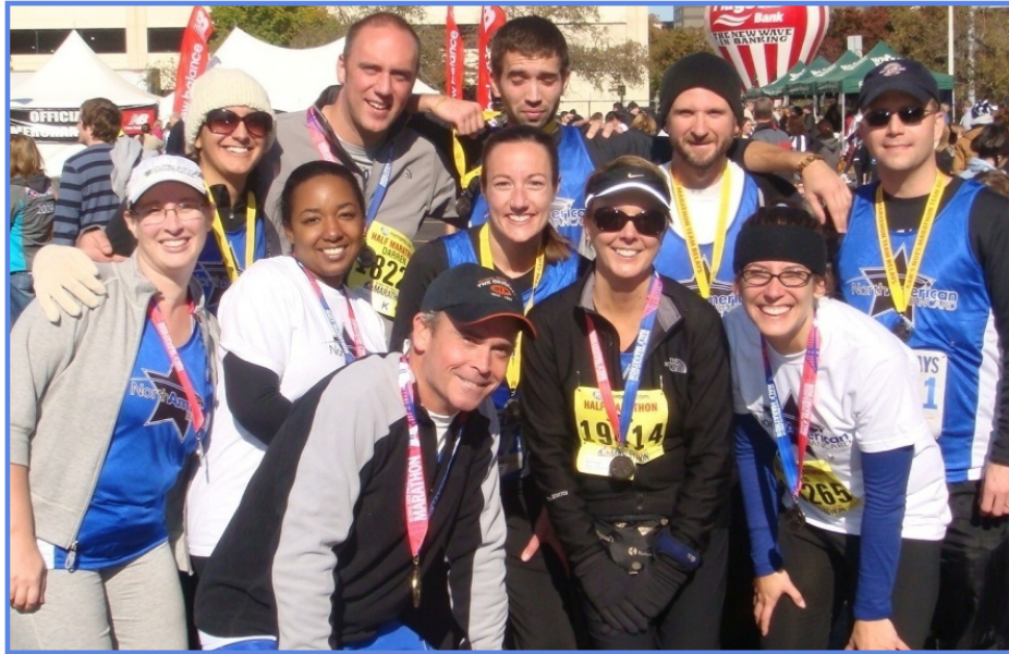
2009 Free Press Marathon