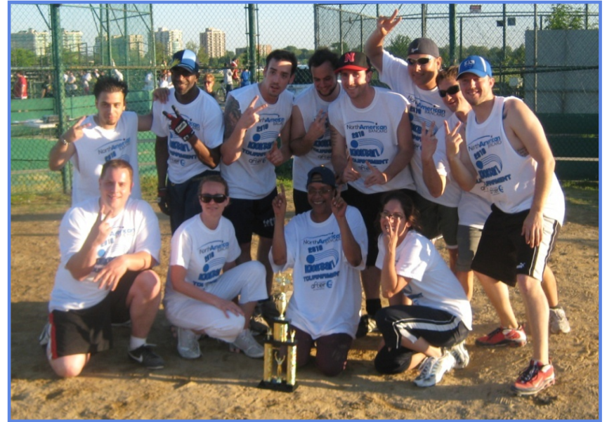
2009/2010 Detroit Kickball Champs