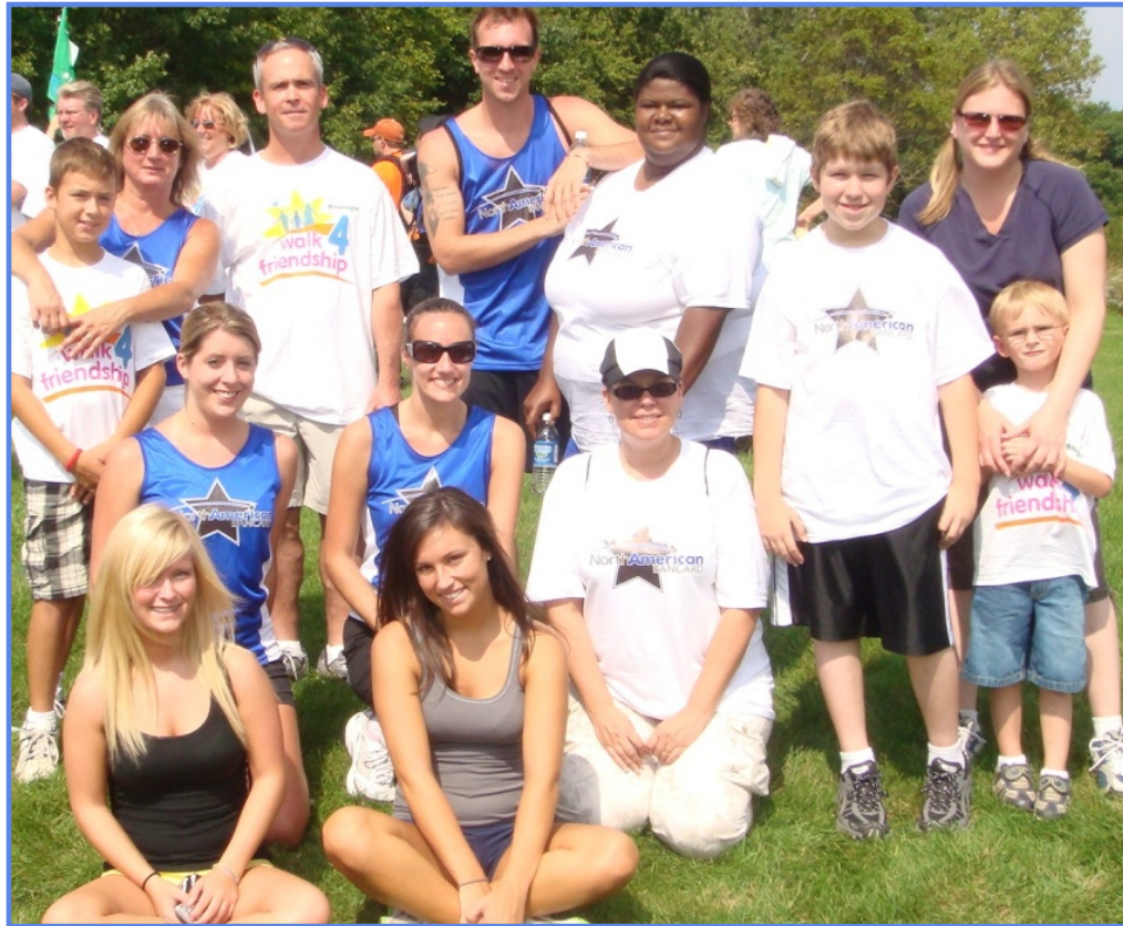
2009 Walk For Friendship